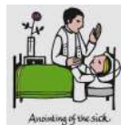
Anointing of the sick.

Our priests regularly visit the sick at hospitals i.e. UH and Columbia Asia. If anyone needs anointing, please contact the parish office.