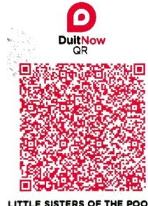
LITTLE SISTERS OF THE POOR