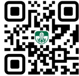
CHURCH OF ST FRANCIS XAVIER

Tuesday – Friday: 9.00 am – 5.00 pm Saturday: 9.00 am – 6.00 pm Sunday: 9.00 am – 1.00 pm (Lunch break: 1.00 pm – 2.00 pm)