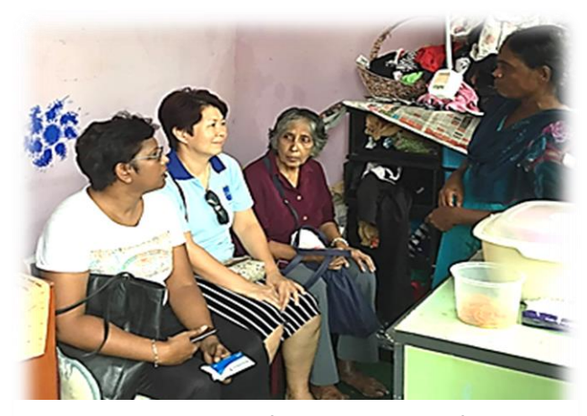
Home visits just before MCO was enforced

The funds were instead credited into the beneficiaries' bank accounts for them to purchase basic necessities. The project has reached out to 99 households, benefitting in total approximately 300 people to date. Out of the total RM35,265 disbursed, 13% was released to support the migrant community via the SFX Migrant Ministry.